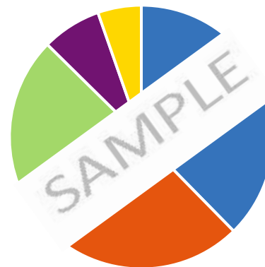
North American Chemical-Based Disinfectants Market Analysis (2017-2026) by Sub-Composition – Alcohols, Aldehydes, Oxidizing Agents, Phenolic Compounds, Quaternary Ammonium Compounds (QACs) and Other Chemical-Based Disinfectants in USD Million

Glance at 2020 Global Disinfectants Market Share (%) by Geographic Region – North America, Europe, Asia-Pacific, South America and Rest of World