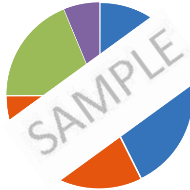
North American Advanced Drug Delivery Systems Market Analysis (2015-2024) by Carrier Type - Nanoparticles, Polymers, Monoclonal Antibodies and Others in USD Million

Glance at 2017 Global Advanced Drug Delivery Systems Market Share by Geographic Region – North America, Europe, Asia-Pacific and Rest of World