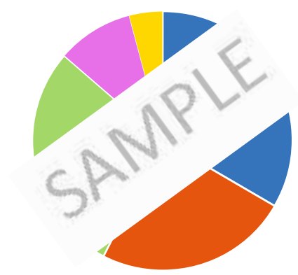
European Heat Exchangers Market Analysis (2016-2025) by Type – Extended Surface Heat Exchangers, Plate Type Heat Exchangers, Regenerators and Tubular Heat Exchangers in USD Million

Glance at 2019 Global Heat Exchangers Market Share (%) by Geographic Region – North America, Europe, Asia-Pacific, South America and Rest of World