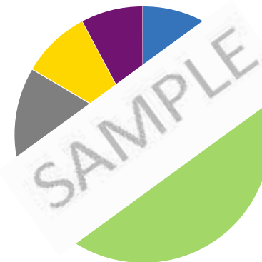
Chinese Mining Equipment Market Analysis (2014-2022) by Equipment Category – Crushing, Pulverizing & Screening Equipment, Drills & Breakers, Mineral Processing Machinery, Surface Mining Machinery, Underground Mining Machinery and Parts & Attachments in USD Million

Glance at 2017 Global Mining Equipment Market Share (%) by Geographic Region – North America, Europe, China, Asia-Pacific (excluding China), Latin America and Middle East & Africa