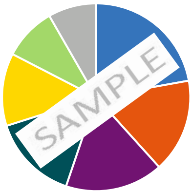
Global AMS Market Analysis (2021-2030) in Hosted Deployments by Geographic Region - North America, Europe, Asia-Pacific, South America and Middle East & Africa in US$ Million

Glance at 2021, 2024 and 2030 Global Application Management Services Market Share (%) by Service Type - Application Security, Cloud Application Migration, Application Portfolio Assessment, Application Modernization, Web Application Security, Mobile Application Security and Other Service Types