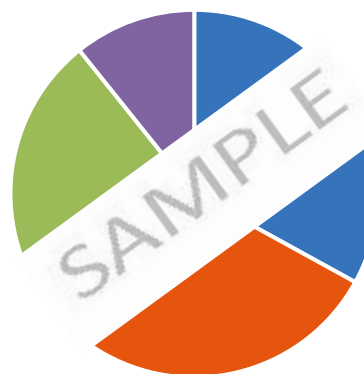
North American Atrial Fibrillation Non-Pharmacological Treatment Market Analysis (2018-2027) by Sub-Type – Catheter Ablation, Electric Cardioversion, High Intensity Focused Ultrasound (HIFU), Maze Surgery and Other Ablation Treatments in USD Million

Glance at 2021 Global Atrial Fibrillation Market Share (%) by Geographic Region – North America, Europe, Asia-Pacific and Rest of World