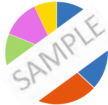
North American Self-Monitoring Blood Glucose (SMBG) Devices Market Analysis (2017-2026) by Product Type – Glucometer Devices, Test Strips and Lancets in USD Million

Glance at 2019 Global Blood Glucose Monitoring (BGM) Devices Market Share (%) by Geographic Region – North America, Europe, Asia-Pacific, South America and Rest of World