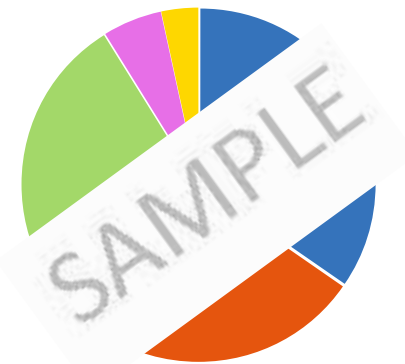
Asia-Pacific Animal Protein Ingredients Market Analysis (2016-2025) by Product Type – Whey Protein, Milk Protein, Gelatin, Casein and Caseinates, Egg Protein and Other Animal Proteins in USD Million

Glance at 2019 Global Protein Ingredients Market Share (%) by Geographic Region – North America, Europe, Asia-Pacific, South America and Rest of World