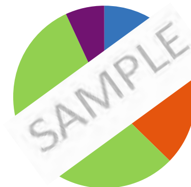
Asia-Pacific Polyols (Sugar Alcohols) Market Analysis (2014-2022) by Product Type – Sorbitol, Mannitol, Maltitol, Xylitol, Erythritol, Isomalt and Lactitol in USD Million

Glance at 2017 Global Polyols (Sugar Alcohols) Volume Market Share (%) by Geographic Region – North America, Europe, Asia-Pacific and Rest of World