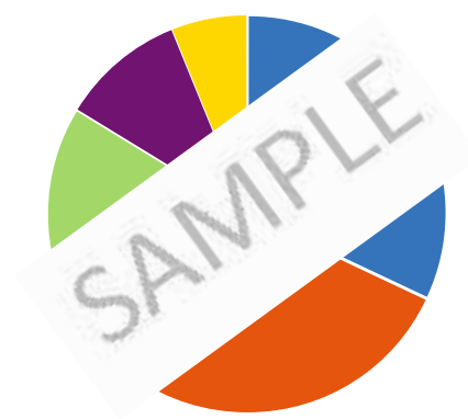
Asia-Pacific Dairy Products Packaging Market Analysis (2015-2024) by Product Type – Bottles & Jars, Cans, Cartons & Boxes, Cups & Tubs, Films & Wraps, Pouches and Other Products in USD Million

Glance at 2018 Global Dairy Products Packaging Market Share (%) by Geographic Region – North America, Europe, Asia-Pacific, South America and Rest of World