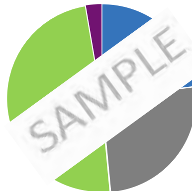
European High Performance Polyamides Market Analysis (2012-2022) by End-Use Sector - Automotive, Electrical & Electronics, Mechanical/Industrial and Other in Metric Tons

Glance at 2017 Global High Performance Polyamides Volume Market Share (%) by Geographic Region - United States, Europe, Asia-Pacific and Rest of World