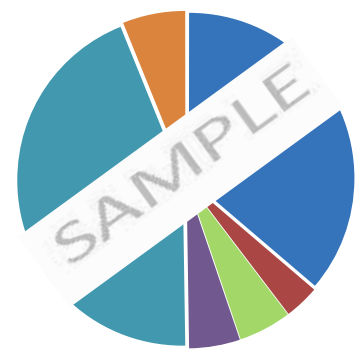
Global Granulated Activated Carbon (GAC) Market Analysis (2012-2022) by Geographic Region – North America, Europe, Asia-Pacific, South America and Rest of World in '000 Metric Tons

Glance at 2017 Global Activated Carbon Volume Market Share (%) by End-Use Sector – Air Purification, Automotive Canisters, Food & Beverages, Medical & Pharmaceutical, Water Treatment and Others