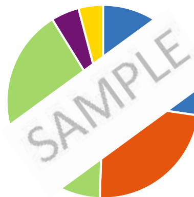
Asia-Pacific Activated Carbon Market Analysis (2017-2026) by End-Use Sector – Air Purification, Automotive Canisters, Food & Beverages, Medical & Pharmaceutical, Water Treatment and Others in Thousand Metric Tons

Glance at 2019 Global Activated Carbon Value Market Share (%) by Geographic Region – North America, Europe, Asia-Pacific, South America and Rest of World