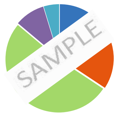
Global Construction Chemicals Market Analysis (2012-2022) by Chemical Type – Adhesives & Sealants, Asphalt Modifiers, Concrete Admixtures, Flame Retardants, Protective Coatings, Waterproofing Chemicals and Other Construction Chemicals in USD Million