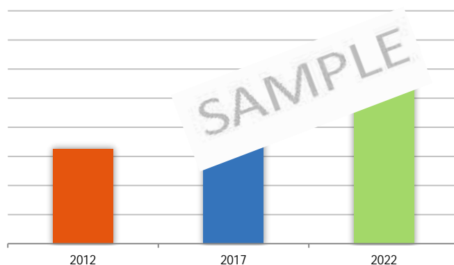
Global Construction Chemicals Market Analysis (2012-2022) in USD Million

This 424 page global Construction Chemicals market report includes 214 charts (includes a data table and graphical representation for each chart), supported with meaningful and easy to understand graphical presentation, of market numbers. This report profiles 10 key global players and 43 major players across North America – 19; Europe – 14; Asia-Pacific – 8; and Rest of World – 2. The research also provides the listing of the companies engaged in manufacturing and supply of Construction Chemicals. The global list of companies covers the address, contact numbers and the website addresses of 233 companies.