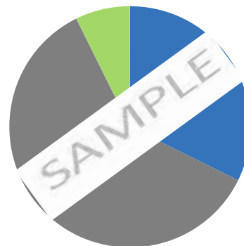
Global Bisphenol-A Market Analysis (2012-2022) by Geographic Region – North America, Europe, Asia-Pacific and Rest of World in '000 Metric Tons

Glance at 2017 Global Bisphenol-A Volume Market Share (%) by Application – Epoxy Resins, Polycarbonates and Other Applications