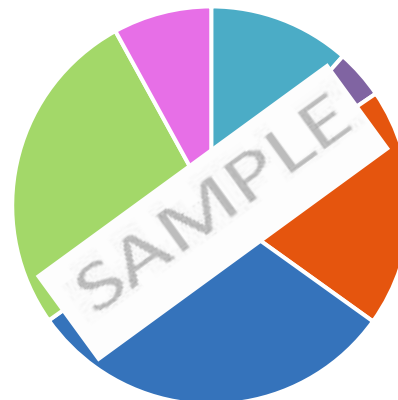
Global Food Safety Testing Market Analysis (2021-2030) by Application – Beverages, Cereals, Grains & Pulses, Dairy Products, Meat, Poultry & Seafoods, Processed Foods and Other Applications in USD Million

Glance at 2021, 2024 and 2030 Global Food Safety Testing Market Share (%) by Application – Beverages, Cereals, Grains & Pulses, Dairy Products, Meat, Poultry & Seafoods, Processed Foods and Other Applications