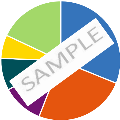
Global Reagents & Consumables of Autoimmune Disease Diagnostics Market Analysis (2022-2032) by Geographic Region - North America, Europe, Asia-Pacific, South America and Rest of World in US$ Million

Glance at 2022, 2025 and 2032 Global Autoimmune Disease Diagnostics Market Share (%) by Test Type - Antinuclear Antibody (ANA) Tests, Autoantibodies and Immunologic Tests, Complete Blood Count (CBC), C-reactive Protein (CRP) Test, Urinalysis Tests and Other Tests