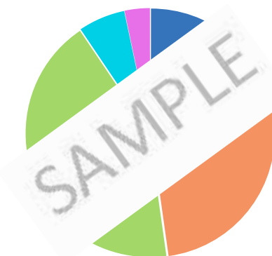
Asia-Pacific Inorganic Pigments Market Analysis (2014-2023) by Type – Cadmium, Carbon Black, Chromium Oxide, Iron Oxide, Titanium Dioxide and Other Inorganic Pigments in USD Million

Glance at 2018 Global Inorganic Pigments Market Share (%) by Geographic Region – North America, Europe, Asia-Pacific, South America and Rest of World