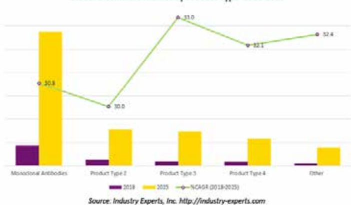
Global Biosimilars Market by Product Type 2018-2025